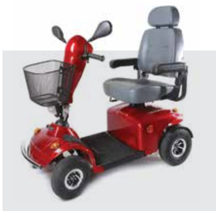
Freerider Mayfair 4

Max weight capacity: 133kg Max speed: 4mph Max range*: 20 miles