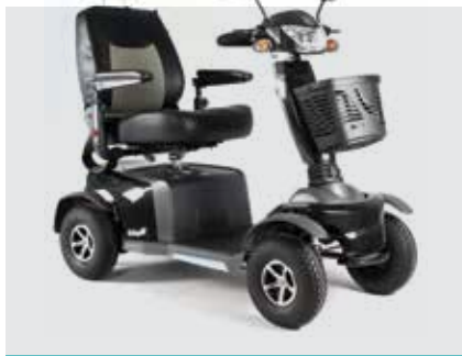
Van Os Medical Excel Galaxy 4 Max weight capacity: 175kg Max speed: 8mph Max range*: 30 miles