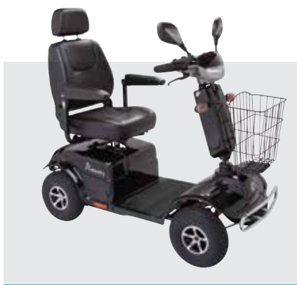
Electric Mobility Rascal Pioneer Max weight capacity: 159kg Max speed: 8mph Max range*: 35 miles