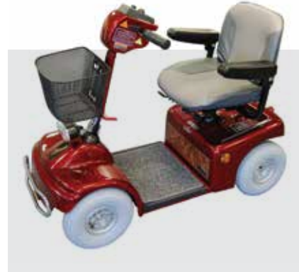
Roma Medical Shoprider Deluxe

Max weight capacity: 136kg Max speed: 4mph Max range*: 25 miles