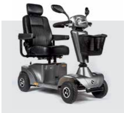
Sunrise Medical Sterling S400

Max weight capacity: 136kg Max speed: 4mph Max range*: 22 miles