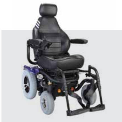
Karma Leon Captain seat/Sling seat

Max weight capacity: 140kg Max speed: 8mph Max range*: 18 miles