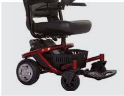
Van Os Medical Excel Quest

Max weight capacity: 115kg Max speed: 4mph Max range*: 20 miles