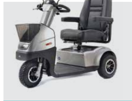
TGA Midi Breeze 3 Max weight capacity: 130kg Max speed: 8mph Max range*: 20 miles