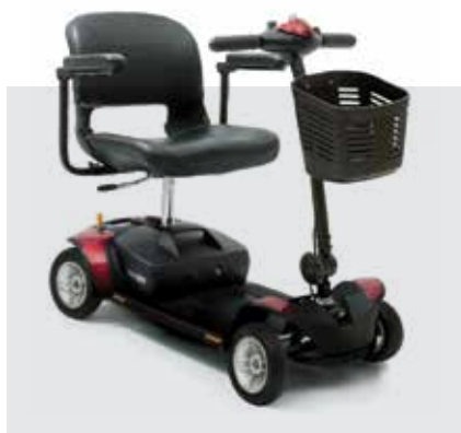
Pride Go-Go Elite Traveller 4 12amp Max weight capacity: 136kg Max speed: 4mph Max range*: 10 miles