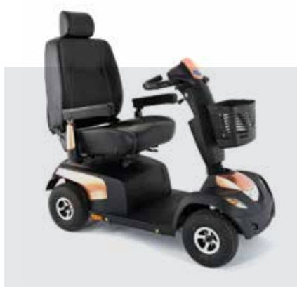
Invacare Comet Ultra 4w Max weight capacity: 220kg Max speed: 6mph Max range*: 36 miles