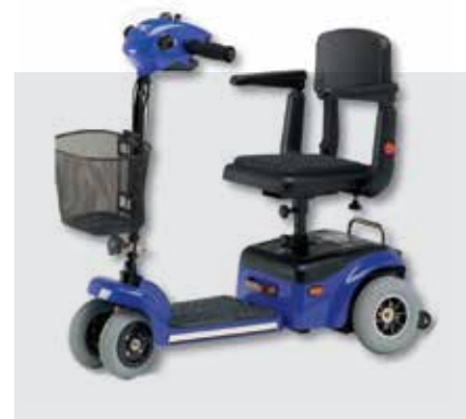
Roma Medical Whisper Max weight capacity: 100kg Max speed: 4mph Max range*: 7 miles