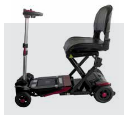
Monarch Smarti Max weight capacity: 135kg Max speed: 4mph Max range*: 10 miles