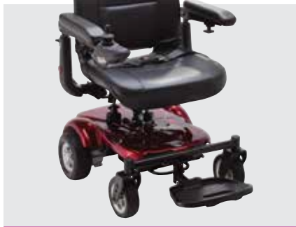
Electric Mobility Rascal P321

Max weight capacity: 113kg Max speed: 4mph Max range*: 8 miles