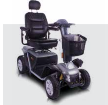
Pride Colt Executive Max weight capacity: 181kg Max speed: 8mph Max range*: 15 miles