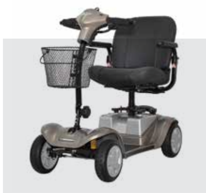
Kymco Mini Comfort Max weight capacity: 135kg Max speed: 4mph Max range*: 16 miles