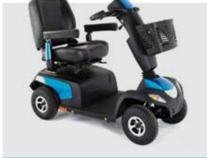
Invacare Orion Pro 4w Max weight capacity: 160kg Max speed: 8mph Max range*: 32 miles