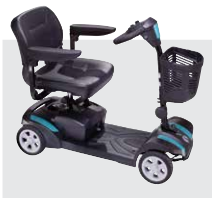
Electric Mobility Rascal Veo X Max weight capacity: 129kg Max speed: 4mph Max range*: 13 miles