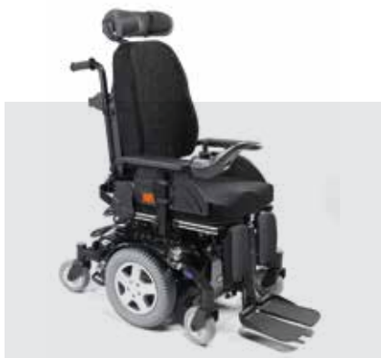
Invacare TDX2 SB - Modulite Configured M52

Max weight capacity: 180kg Max speed: 6mph Max range*: 24 miles