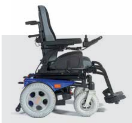
Sunrise Medical Quickie Salsa R2 Lift & Tilt (configured)

Max weight capacity: 140kg Max speed: 6mph Max range*: 20 miles