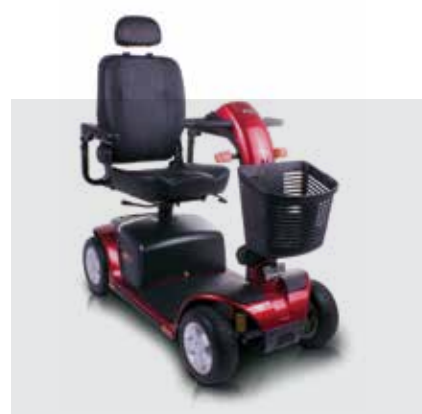
Pride Colt Deluxe

Max weight capacity: 159kg Max speed: 6mph Max range*: 25 miles