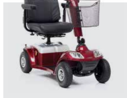
Kymco Super 4 ForU

Max weight capacity: 127kg Max speed: 4mph Max range*: 20 miles