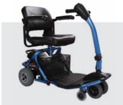
Electric Mobility Rascal Liteway Balance Plus

Max weight capacity: 136kg Max speed: 4mph Max range*: 16 miles