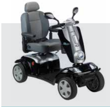
Kymco Maxi XLS Max weight capacity: 200kg Max speed: 8mph Max range*: 35 miles