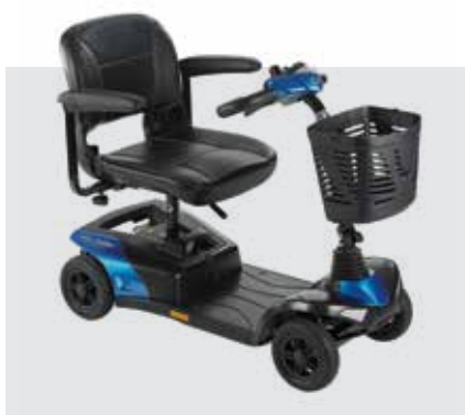
Invacare Colibri 12 Max weight capacity: 136kg Max speed: 4mph Max range*: 10 miles