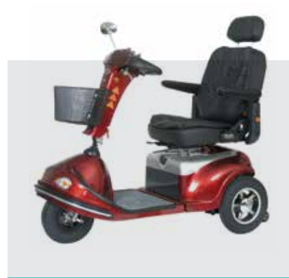
Roma Medical Torino Max weight capacity: 220kg Max speed: 8mph Max range*: 34 miles