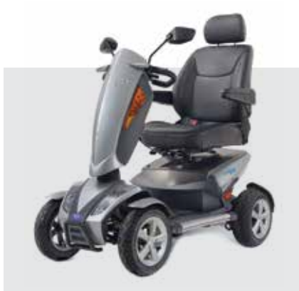
TGA Vita 4 Max weight capacity: 179kg Max speed: 8mph Max range*: 20 miles