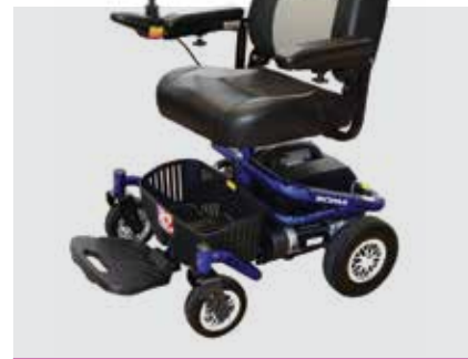
Roma Medical Reno II

Max weight capacity: 136kg Max speed: 4mph Max range*: 12.2 miles